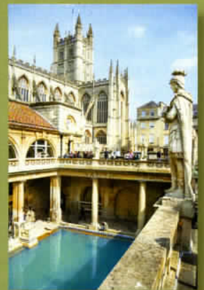
Bath Abbey and the Roman Baths