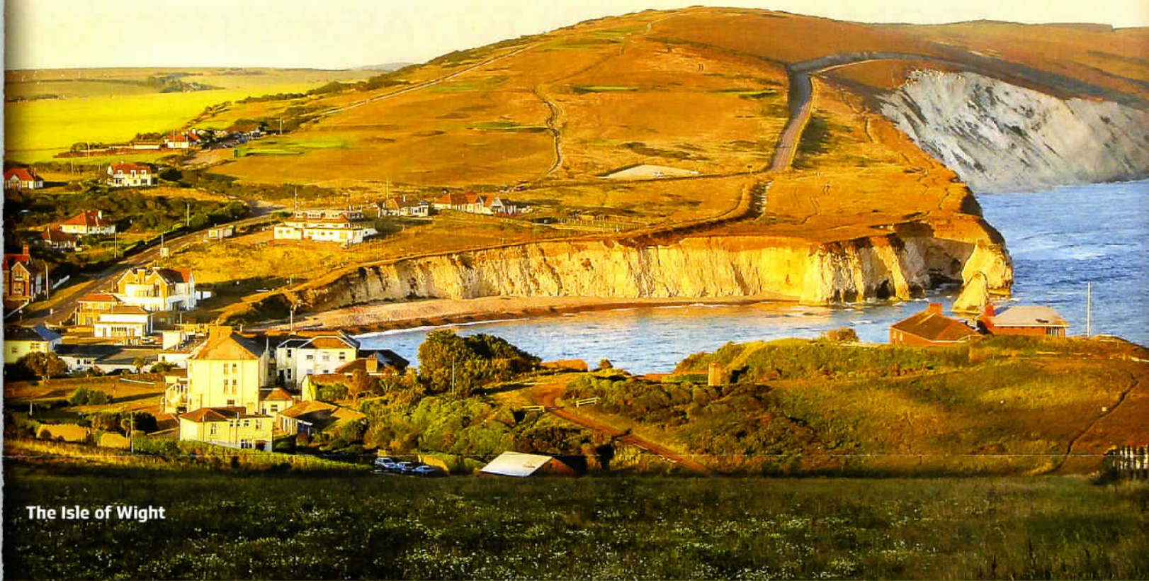
The Isle of Wight

Come join the Yarmouth Historical Society as we journey to Yarmouth on the charming Isle of Wight with stops in London and delightful sites in the surrounding countryside. We will end the trip at the famous Isle of Wight Walking Festival.